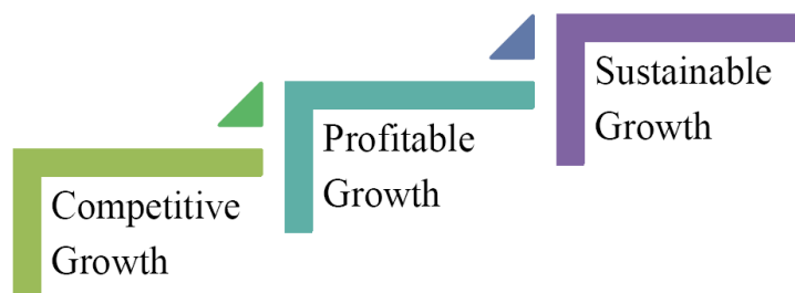
Figure3. Hindustan Unilever Strategy