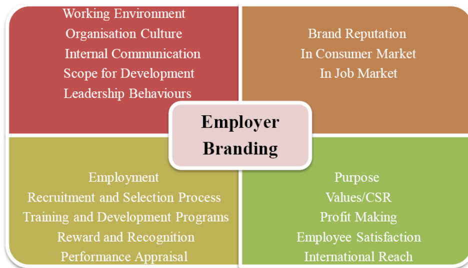
Figure2. Effective Employer Branding