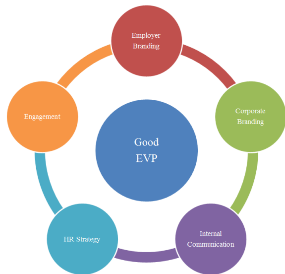
Figure 4. Elements of Good EVP

Employment Value Proposition (EVP). It is a term used frequently within human capital management circles, and as recent Brandon Hall Group research shows, training and development has a big impact on it. EVP is a construct of what employers and employees value in each other. It is based on a series of pillars that describe different aspects of an organization's relationship with their employees.